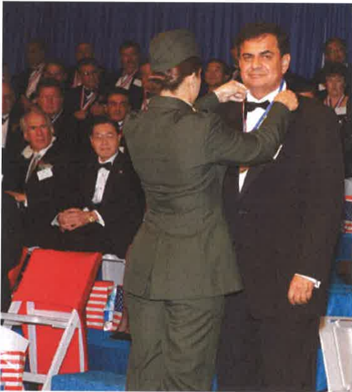
Ellis Island Medal of Honor Award 2005