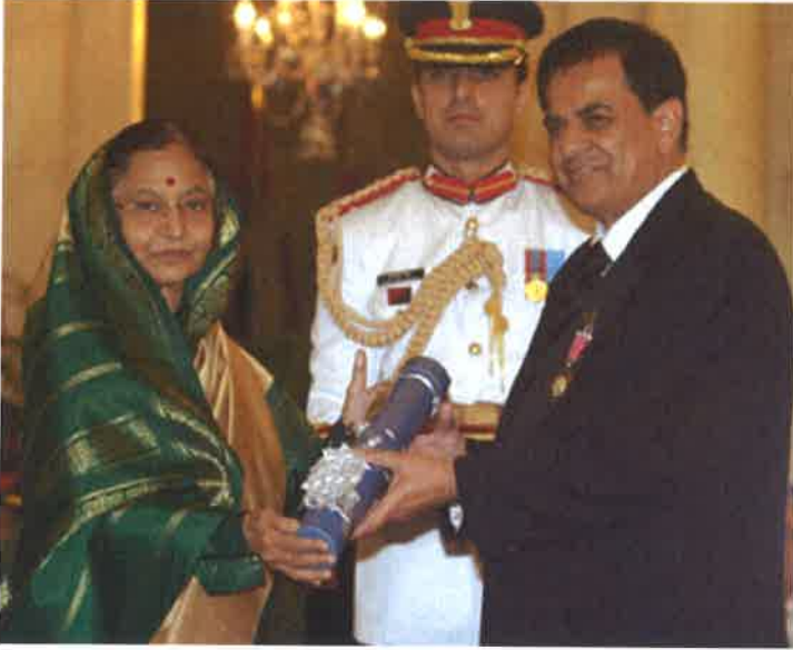
Padma Shri Award 2010