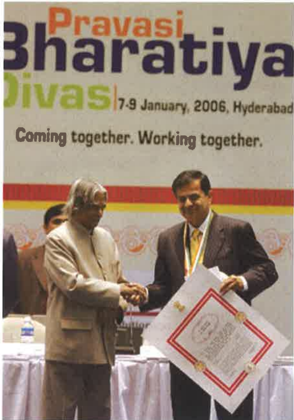
Pravasi Bharatiya Divas Samman Award 2006