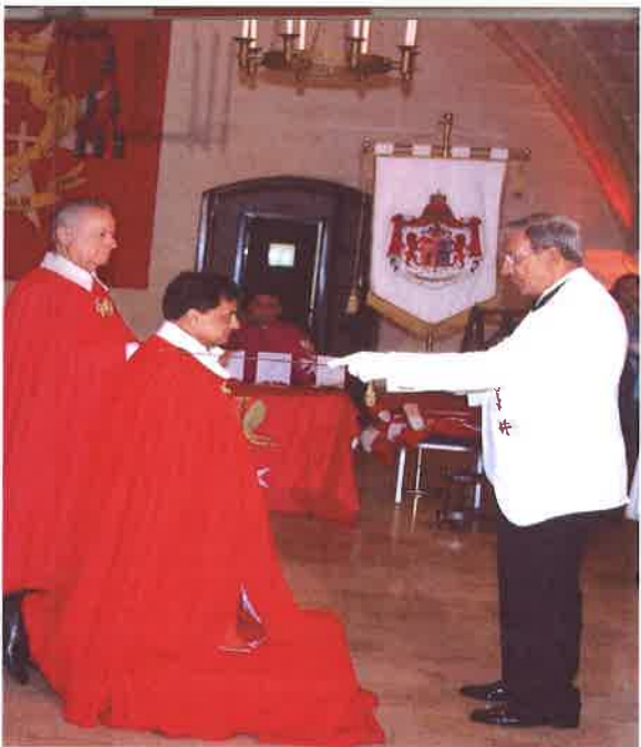
Knighthood of Malta 2012